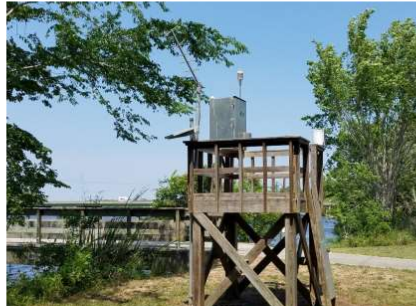
USGS real-time water monitoring gage at GA 25 Kings Ferry (Node) Park, Chatham County